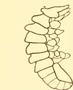
FIG. 3.— COLOPHRYXUS NOVANGLIE. MALE X 27½.

The type is in the U. S. National Museum and is Cat. No. 38958.